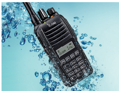
Waterproof for 30 minutes at one meter