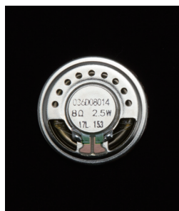
Icom custom high power handling capacity speaker