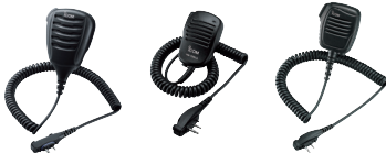
HM-168LWP HM-158LA HM-159LA

HM-168LWP: Waterproof speaker microphone with a waterproof connector. IP67 protection. HM-158LA: Compact speaker microphone with 3.5 mm earphone jack. HM-159LA: Speaker microphone with 3.5 mm earphone jack.