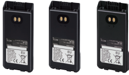
BP-278 BP-279 BP-280

BP-278: 1190 mAh (typ.), 1130 mAh (min.) rechargeable Li-ion battery. BP-279: 1570 mAh (typ.), 1485 mAh (min.) rechargeable Li-ion battery. BP-280: 2400 mAh (typ.), 2280 mAh (min.) rechargeable Li-ion battery.