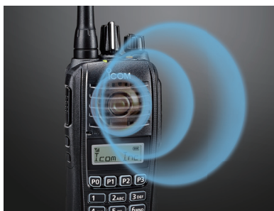
1500 mW powerful audio